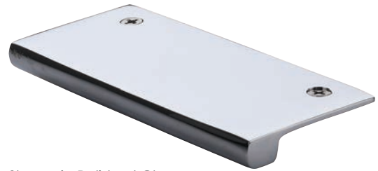
Shown in Polished Chrome