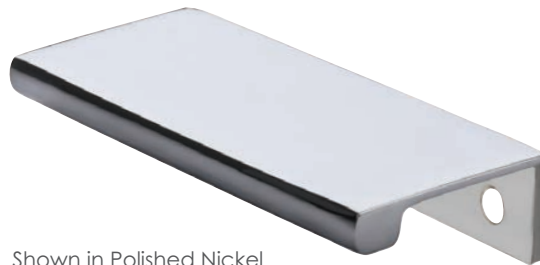
Shown in Polished Nickel