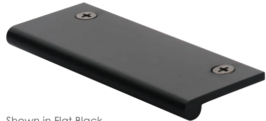
Shown in Flat Black